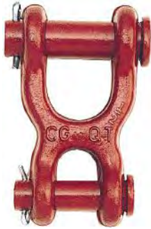
S-247 Double Clevis Link