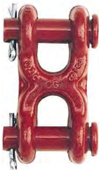
S-249 Twin Clevis Link

Not Suitable for use with Grade 80 or Grade 100 chain and chain slings used in overhead lifting.